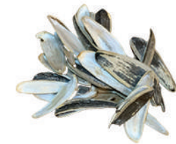
sunflower seed shells