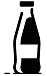
mineral water (with lemon)