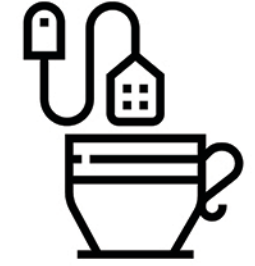
tea grounds (wasted)