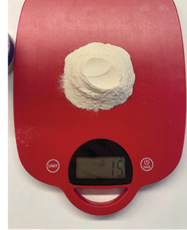
15 GR. AGAR AGAR