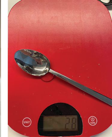
4 GR GLYCEROL