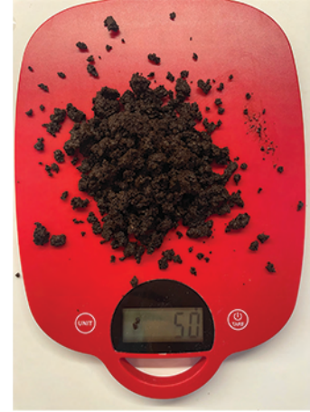
50 GR COFFEE