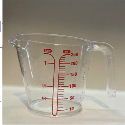
5 ML VINEGAR