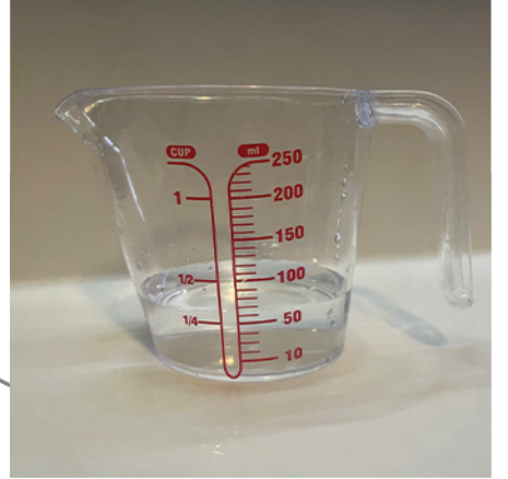
65 ML WATER