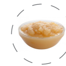
APPLE JAM 04 8/1 cup