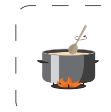
medium heat for 6 min