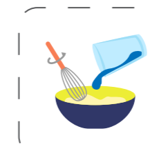
Mix all ingredients