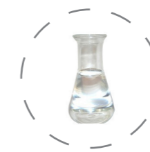
Glycerin 03 8/1 cup