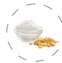
Corn starch 02 8/1 cup