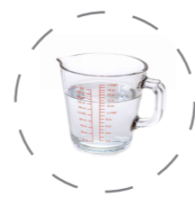
Water 01 4/1 1 cup