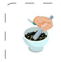
mix gelatin+ Carbon