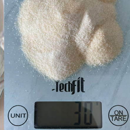
40 GR. GELATIN