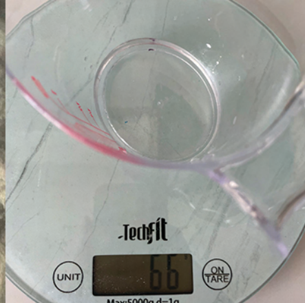
20 GR. GLYCEROL