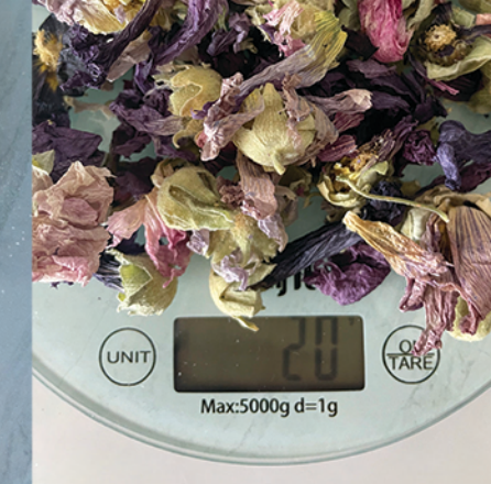
20 GR. FLOWES