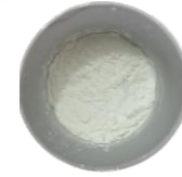
Corn starch: 20g