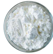
Corn starch: 12g