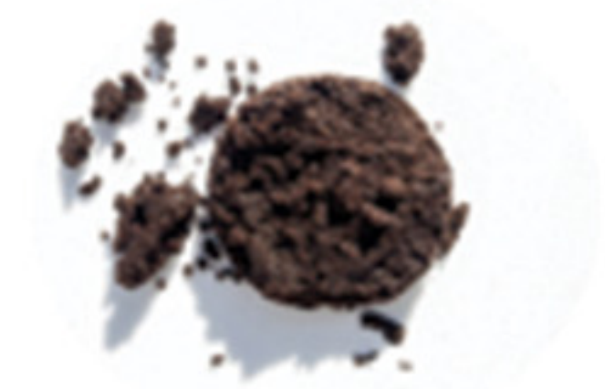
Turkish Coffe Waste